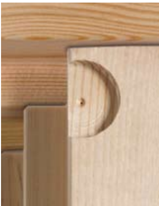
Pot hole without positioning pins